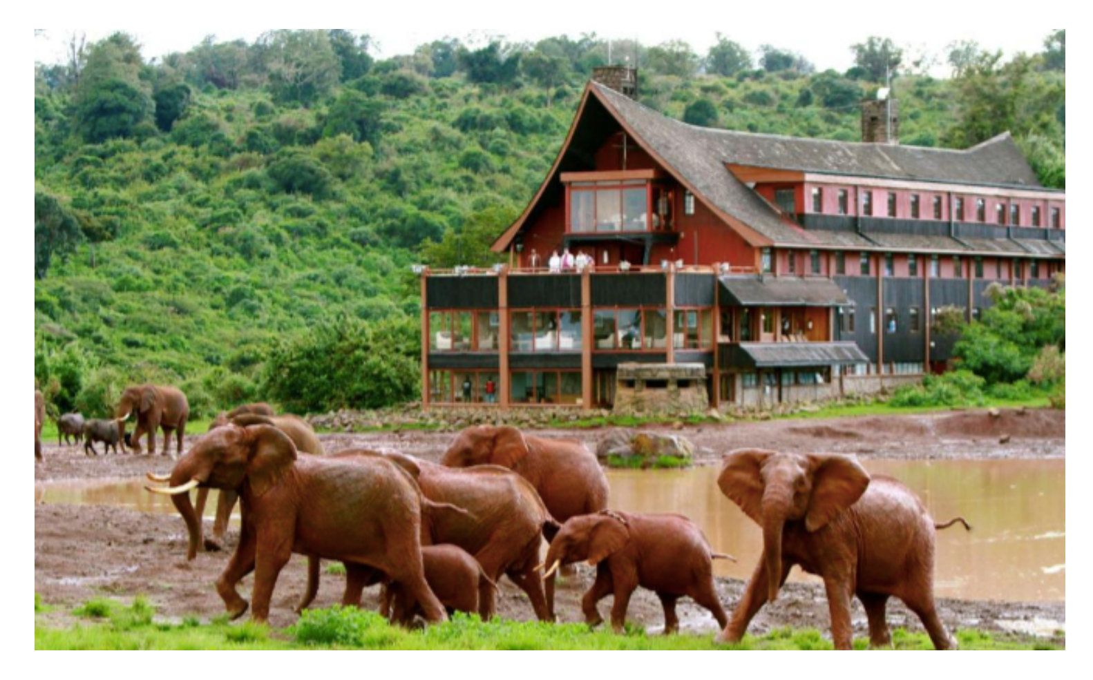
DAY THREE: SAMBURU GAME RESERVE